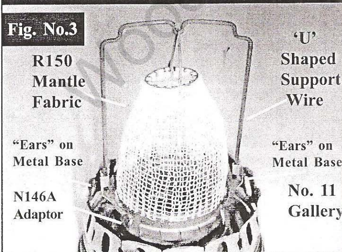
Model No. 11 Gallery with Adaptor Installed