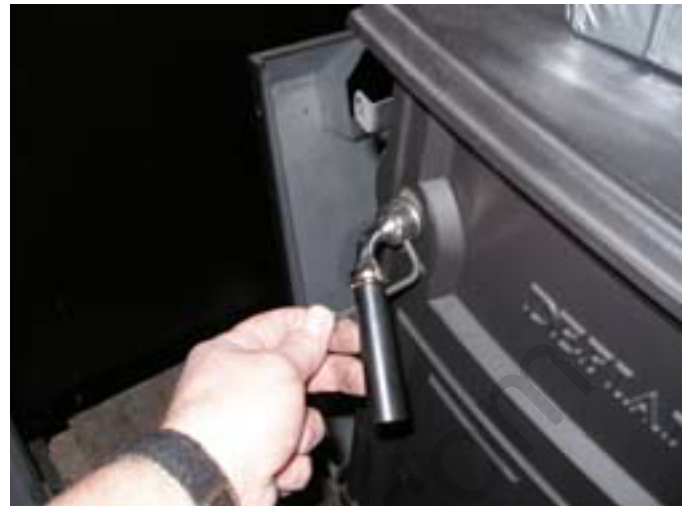
Fig. 5 Remove damper handle.