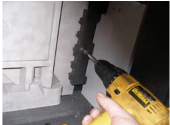
Fig. 7 Remove fireback brackets.