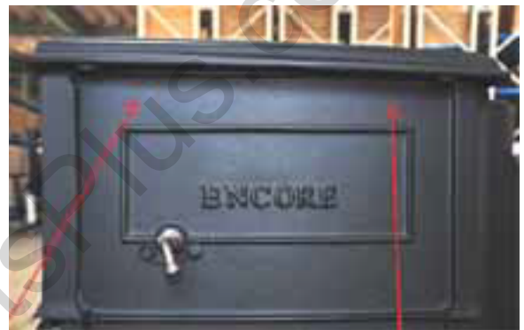
Fig. 9 Stove top that is not level.