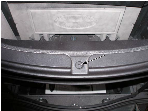
Fig. 4 Remove flat head socket screw.