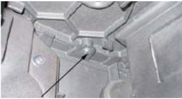
Fig. 3 Remove top bolts in rear corners.