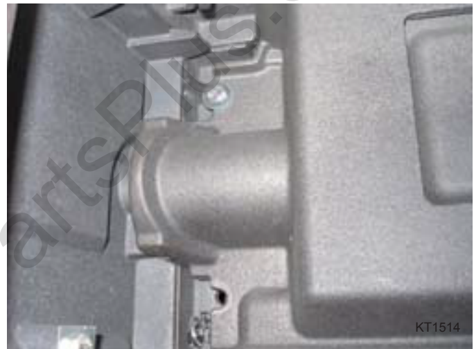
Fig. 6 Defiant damper housing with one (1) bolt removed.