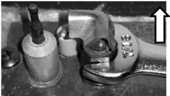
Figure 8 – Loosening Pilot Tower