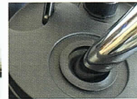
Rubber expands to seal most vacuum hoses. If seal does not fit try another vacuum.

Clean filter thoroughly after each use, see sidebar to left.