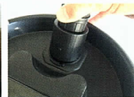
Insert included pickup hose into receiver on lid. Line up pin so it will drop in slot.