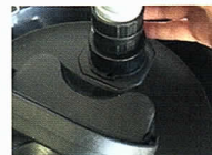
Twist hose to lock into lid.

Ash is very insulating and embers may stay lit for several hours after a fire is "out". If you shovel out most of the debris (into a fireproof ash pail) pay attention for glowing embers. If seen make sure there are none remaining when using the vacuum.