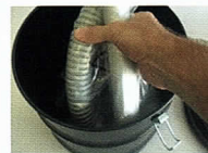
Release lid and remove all contents from inside canister

Follow instructions carefully and you will enjoy long service of your Ash Buster. It saves your household vacuum from being contaminated by ash which can be corrosive. As such, and for safety reasons, the Ash Buster should be emptied after each use.