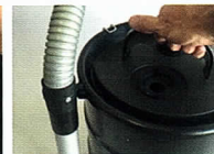
Put nozzle on hose end and attach to side of canister.