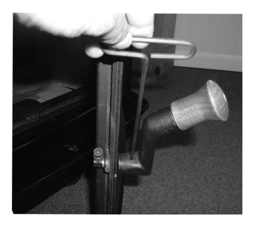
MANCHESTER FRONT DOOR LATCH INSTALLATION