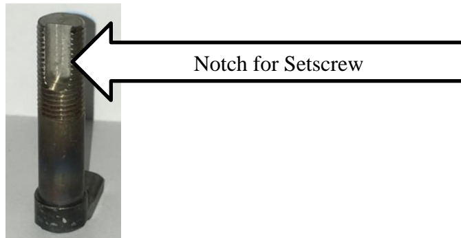
Figure 2: Latch shaft showing detail of groove of the edge where the set screw will lock into place.